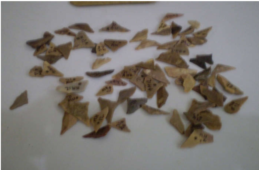
Photo 12: Trapezes, points triangles and angle bores collected from Mulri Hill