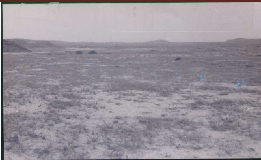
Photo 3: Mesolithic sites on the Mulri Hill.

The windblown silt and surface runoff weathered clay and shale deposits formed fertile grazing lands suitable for animals grazing. The presence of rainwater storage through stone embankments hypothetically indicates that the Mesolithic people knew the technique of collecting rainwater used for drinking. Evidences of springs originated from faults were also found which were active up to 1980s (Photos 3 & 4).