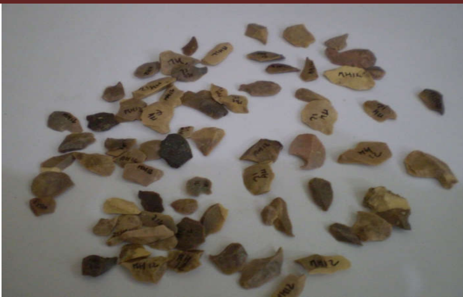
Photo 11: Trapeze, points, angle bore; important Mesolithic flint-chert made tool collected from Mulri Hill