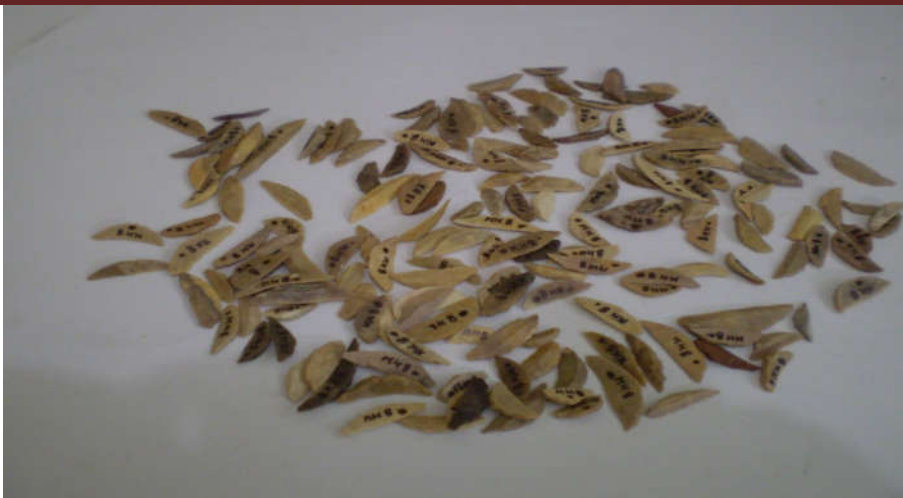
Photo 6: Different sizes and shapes of Lunates, important Mesolithic flint-chert made tool collected from Mulri Hill