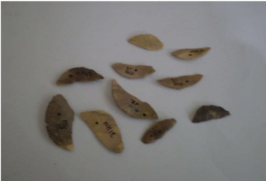
Photo 10: Different types of lunates collected from collected from Mulri Hill

The second step of making different types of microliths was the selection of tool according to the requirement of Mesolithic communities. The Mesolithic community of Mulri Hill was neither fishermen nor farmers. The tradition which still exist in the region of Sindh Kohistan and Gadap region of Karachi that inhabited communities are originally grazers because after monsoon rain the area provide grazing lands for herders. Therefore it can be hypothetically believe that the Mesolithic community of the Mulri Hill was basically grazers inhabited in the area either seasonally or permanently. Therefore microliths found in this area were mostly used in cutting grasses. Sharp edges Lunates, triangles, blades and trapezes were fixed in wood for cutting grasses. No hunting tools like bow and arrow, spears were found from the Mulri Hill (Photos 10, 11 & 12).