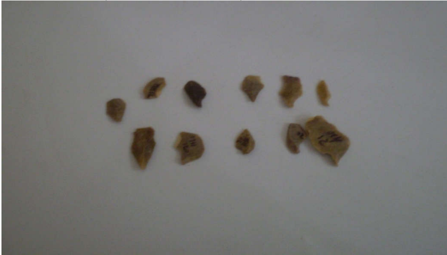
Photo 16: Different types of bores and micro burins collected from Mulri Hill

The Mesolithic community of Mulri Hill was expert of making such sophisticated and technologically advance microlithic flint tools of burin and micro burin (Photo 13, 14, 15 & 16).