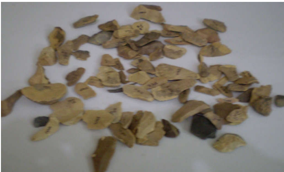
Photo 5: Different types of flint-chert microliths explored from Mesolithic sites of Mulri Hill

The assemblages collected from the Mulri Hill were made of flint or chert. These are not found locally. There were three sources of flint or chert nodules, used by Mesolithic grazers of the Mulri Hill. They are located within the range of 200 kilometers (Photos 5 & 6).