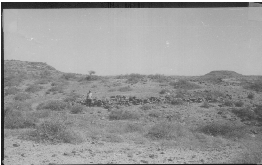
Photo 4: A rainwater storage built with stones.

The windblown silt and surface runoff weathered clay and shale deposits formed fertile grazing lands suitable for animals grazing. The presence of rainwater storage through stone embankments hypothetically indicates that the Mesolithic people knew the technique of collecting rainwater used for drinking. Evidences of springs originated from faults were also found which were active up to 1980s (Photos 3 & 4).