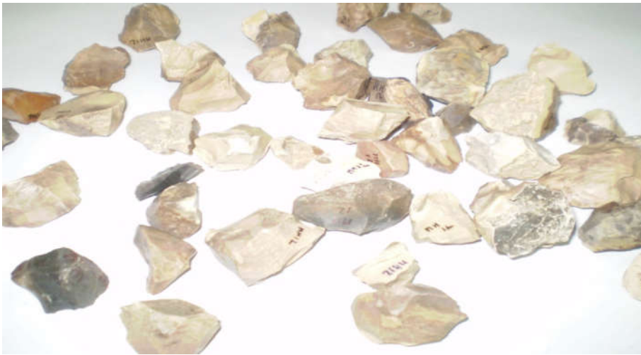
Photo 8: Different shape of cores used for making microliths, collected from the Mulri Hill