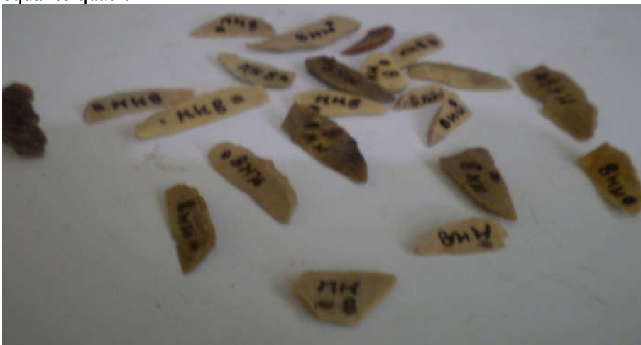
Photo 7: Trapeze, points, angle bore; important mesolithic flint-chert made tool collected from Mulri Hill

The reddish chert nodules were brought from Gadani, 60 kilometers away along the Makran coast, the grey and brown chert nodules were brought from Ongar Hill and Thano Bula Khan .It could be possible that special black and pink flint microliths were made of flint nodules found in Rajasthan. The Mesolithic grazers used flint or chert stones for making microlithic artifacts because of their shining texture and hardness which is equal to quartz.