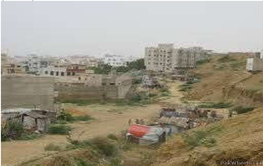
Photo 1: Urban housing on the Mulri Hill, Source: picture taken by authors.

In 1980 an urban housing scheme Gulistan-e-Jauhar was announced in this area and the topographic and archaeological features and sites of Mesolithic settlements have buried under the urban built up landscape (Photo-1).