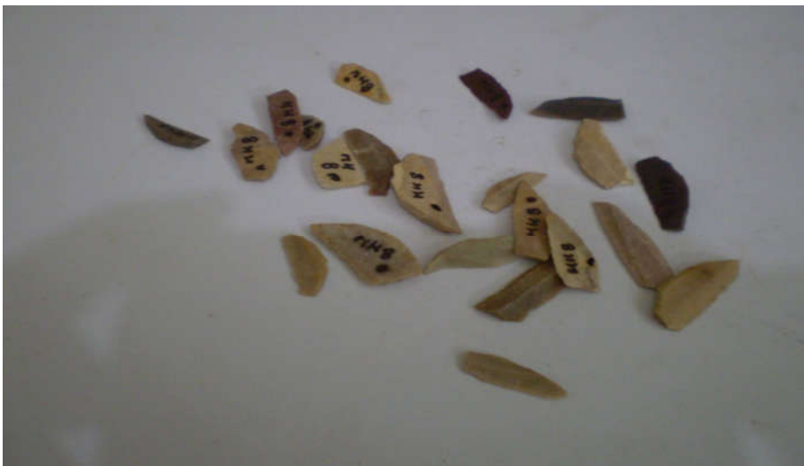
Photo 9: Trapeze, points, angle bores and blades collected from Mulri Hill

The first step of tool making was the development of cores. For this purpose the rough surface of raw flint- chert blocks was removed through flaking techniques. Different small size cores were prepared for making different microliths like lunate, trapeze, triangle, different types of bore and points. Different shapes of cores like circular, cylindrical, hexagonal etc. were found from the sites of Mulri Hill (Photos 7 & 8).