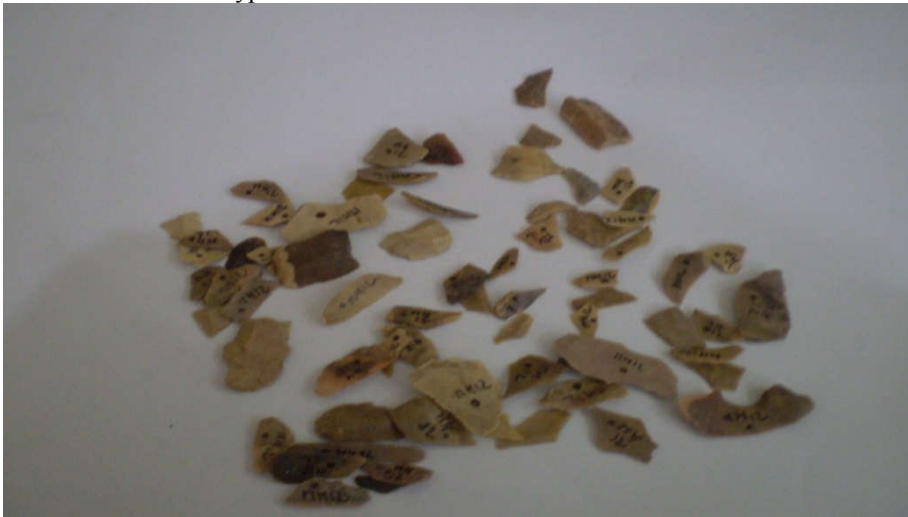
Photo 15: Different types of microliths, collected from Mulri Hill.