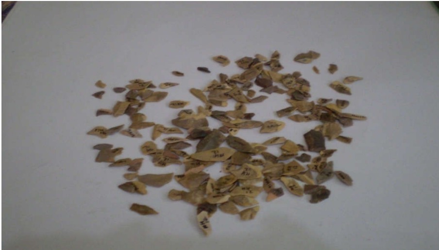
Photo 14: Different types of bores and micro burins collected from Mulri Hill.

Mesolithic communities had learnt how to make holes in wood, pebble stones, bones and hides. For these purposes they also developed different types of small size bores mostly few centimeters in length. Different angular bores and bruins were made from flint or chert cores. For making very small size holes most probably for making stone necklaces and for sewing hides used to cover human bodies and to cover roofs of their houses. Animals' hides were also used for making water buckets. For making very small holes special type of tiny burin were made called micro burin.