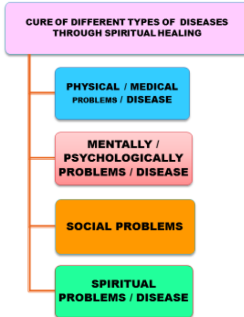
Figure: Cure of different types of diseases