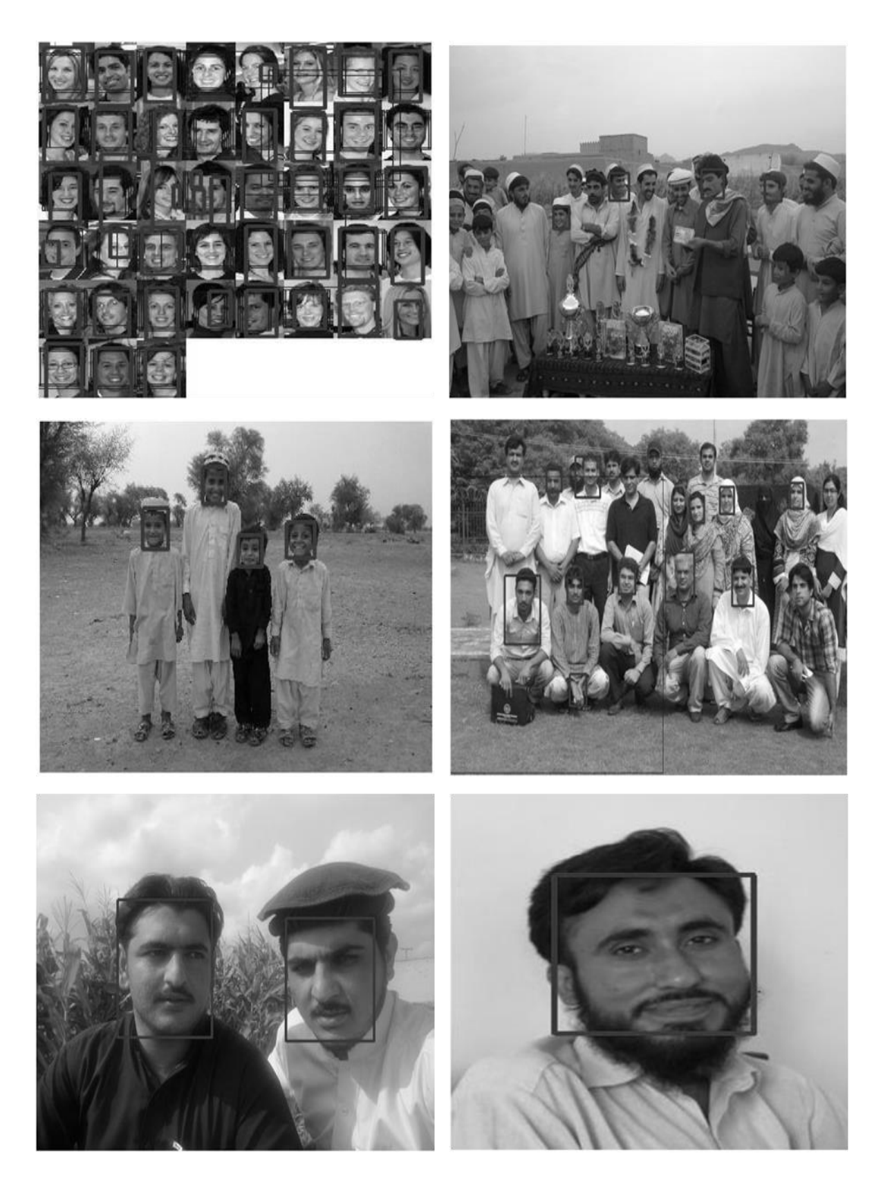
Fig. 1 Face detection Results using Viola-Jones and Hybrid approach