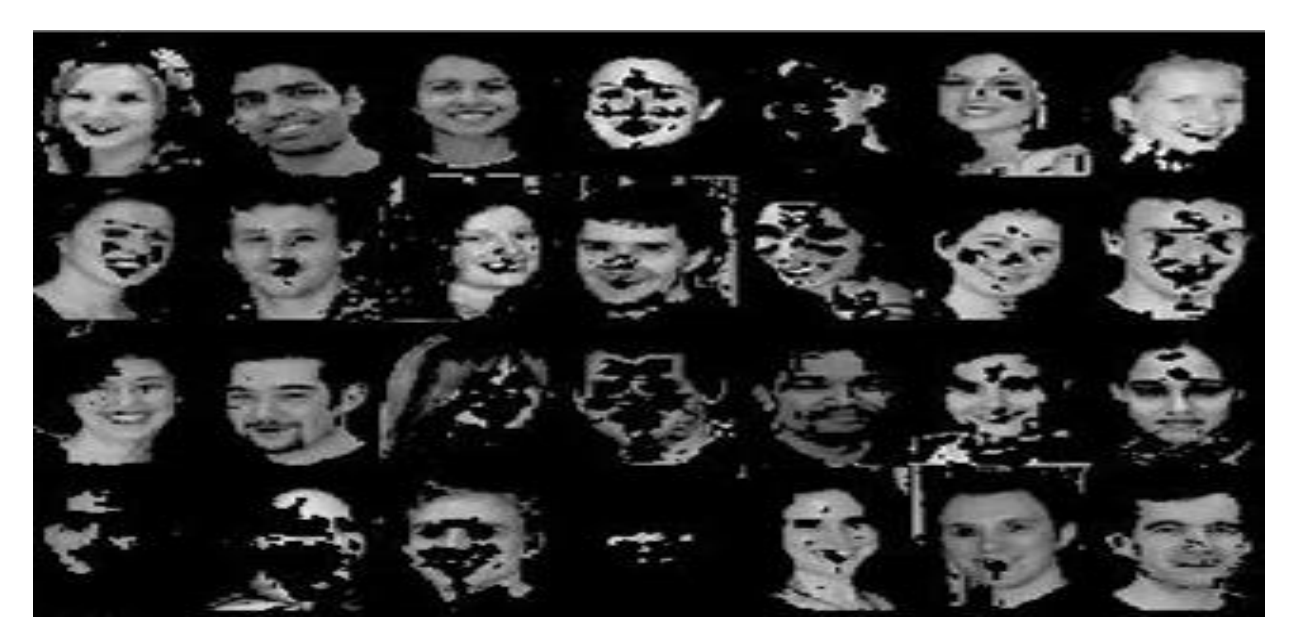
Fig. 2. Results of Color segmentation

Viola-Jones face detection approach and skin detection technique will be able to dodge tricks and traps due to various facial variations. The working of the proposed technique is depicted in (Fig. 1).