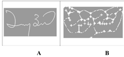
Fig 5: A) Skeletization of Signature B) Feature Extraction

Intersection points and end points are obtained in feature extraction stage. End points have only one neighbour but intersection points have more than two neighbours. (Fig. 5) (A) Shows Skeletization signature (B) Stars indicate intersection points and end point of the signature.