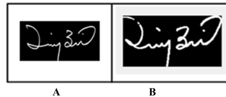
Fig 3: (A) Binarization of Signature (B) Image After Opening

Morphological operation is often performed in digital image processing and deals with shape of signature image. In this phase we have used opening operation on the signature image to break unessential parts. (Fig.3) shows (A) Binarized signature (B) Morphological operation.