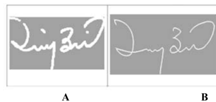
Fig 4: (A) Image after opening (B) Skeletization of Signature

To obtain one pixel signature image value we used skeletization. It removes pixels which are on the margins of objects. The effect of the skeletization is shown in the figure below. (Fig. 4) (A) Signature image after image opening (B) Signature image after skeletization.