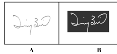
Fig 2: A) Original Signature B) Binarization of Signature

To obtain the white and black pixels of signature, the original signature is converted into binarised form. Otsu’s method (Sezgin, et al., 2004) is implemented for image binarization which automatically executes clustering based Thresholding to covert the image into binary form. The pixels having intensity greater than a threshold are converted to white and less than the threshold are converted to black as shown in the figure below. (Fig. 2) shows (A) Original signature (B), Binarized signature.