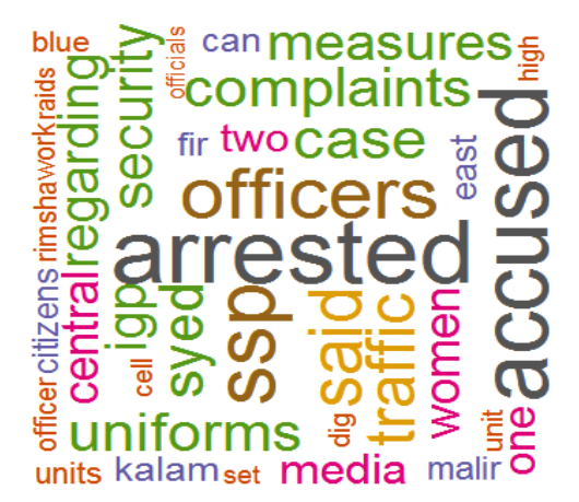
Fig. 1. Word cloud Facebook page of Sindh Police

While observing keyword "traffic", the posts related to accidents are highlighted. Furthermore, the traffic contention due to celebrities, and sewage water break are also highlighted. The term "bribe" and "bad performance" is noticed. For security measures, the keywords delegation, checking, duties and monitoring are prominent.