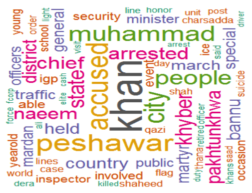
Fig.4. Word cloud Facebook page of KPK police

As observed from table 5, the accuse and arrest of armed killers, murderers, muggers, weapon dealers and drug exporters are prominent. Police attacked by multiple armed persons is highlighted. The news related martyrs' bravery, shaheed's funerals and condolences are highlighted. The inquiries of registered cases are also prominent.