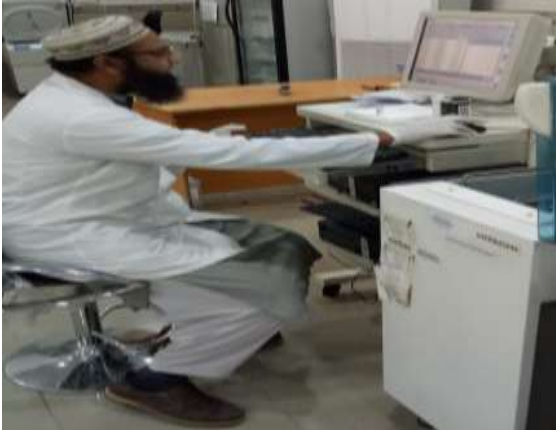
Fig. (1-2) Sample 5ml blood of each 60 obese patients is processing in the lab.